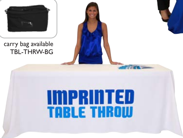
full table throw shown in white fabric with blue and sapphire imprinted vinyl