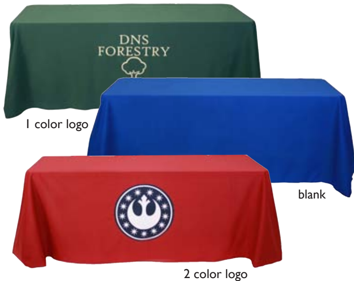
1 color logo