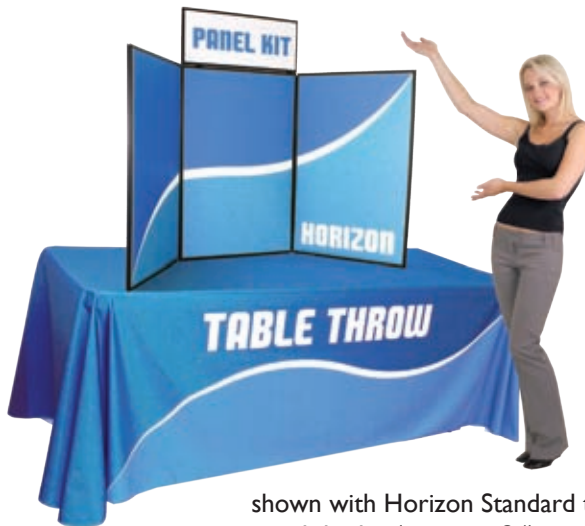
shown with Horizon Standard tabletop folding panel display (see page 34)