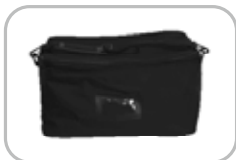
carry bag available TBL-THRWBG