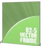
02 Square VF-S-02 47" w x 47" h comes in | OCL case