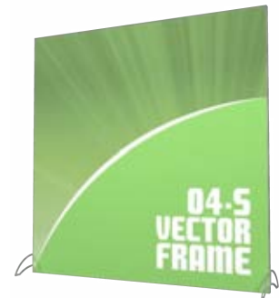
04 Square VF-S-04 94" w x 94" h comes in | OCL case