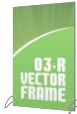
03 Rectangle VF-R-03 47" w x 70" h comes in | OCL case