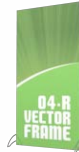
04 Rectangle VF-R-04 47" w x 94" h comes in | OCL case